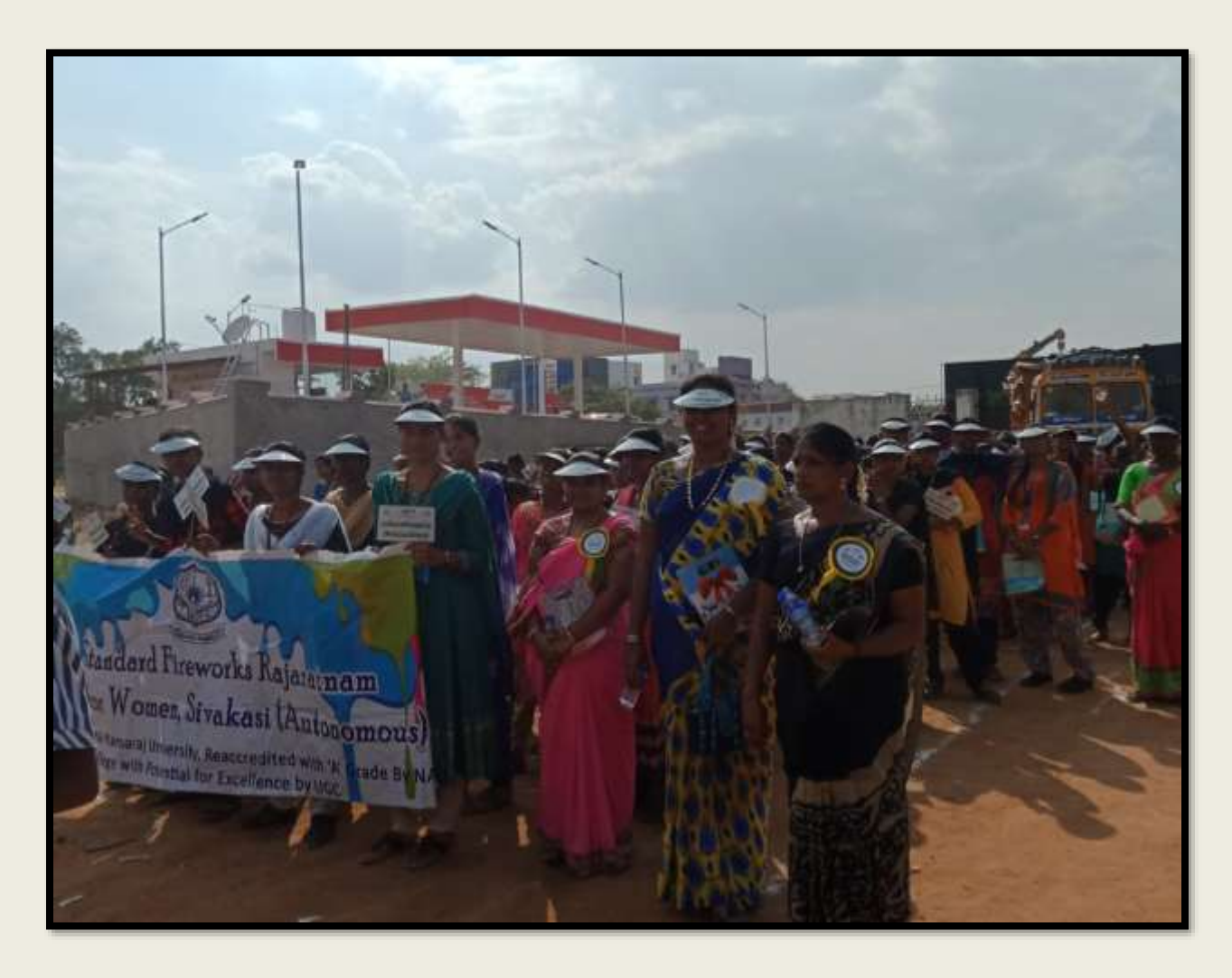
Rally on creating awareness on child abuse

Participants : 100 students and 9 staff members